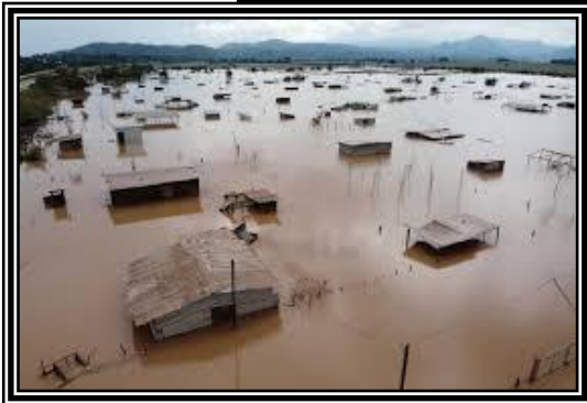
Some effects of climate change.